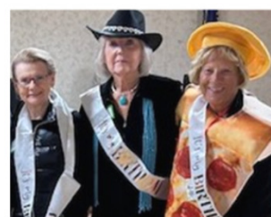
Celebrating October Birthdays