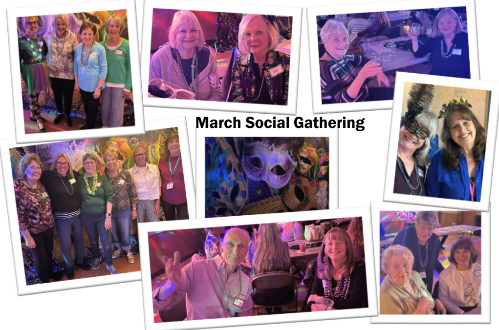
March Social Gathering