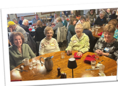
March Fish Fry